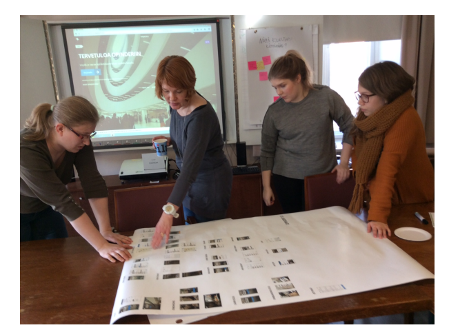
Figure 2. Product Owner and a group of students discussing the concept of the Opinder

The Opinder Beta was launched at the Opening Carnival with limited features: Opinder allowed the students to create events and invite other students to join the events. Again, the students were excited about the idea, but the use of the Opinder remained scarce. We had an interesting product idea, however it had too few features available to attract actual users. Thus, we were at the crossroads: either to develop the Opinder substantially or end the whole project.