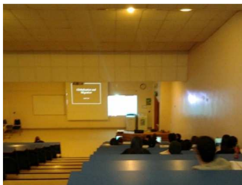
Figure 4. Room physical layout impacts the experience.