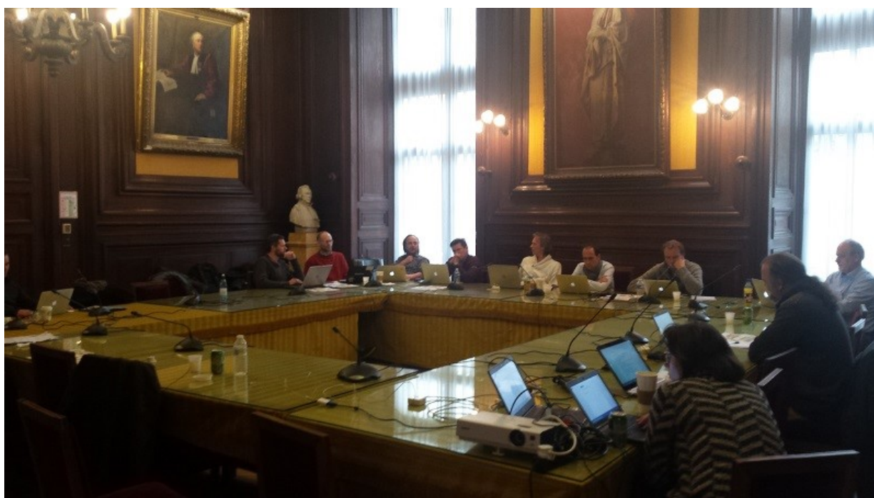
Figure 2: Refining the model at the Jisc / Apereo workshop in Paris

A number of experts from Europe came together in Paris in February 2015 to review Jisc's nascent architecture for learning analytics. The event at L'Université Paris Descartes was jointly hosted by the Apereo Foundation and Jisc. Delegates included representatives from the Universiteit van Amsterdam, the Pädagogische Hochschule Weingarten in Germany, Surfnet in the Netherlands, University of Michigan in the USA, CETIS and the Lace Project, as well as Jisc and Apereo.